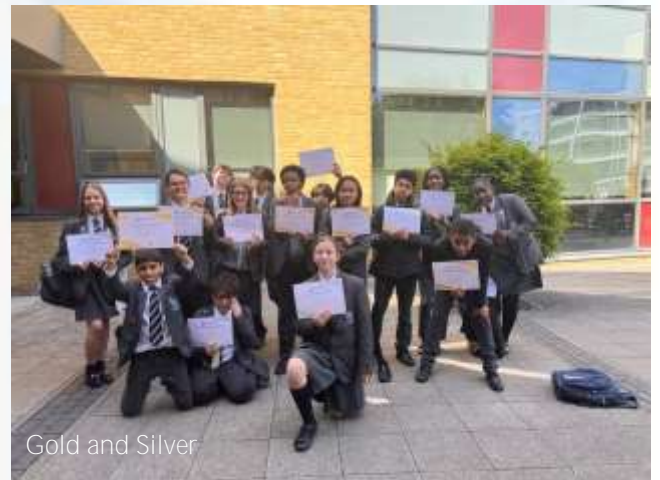
Gold and Silver