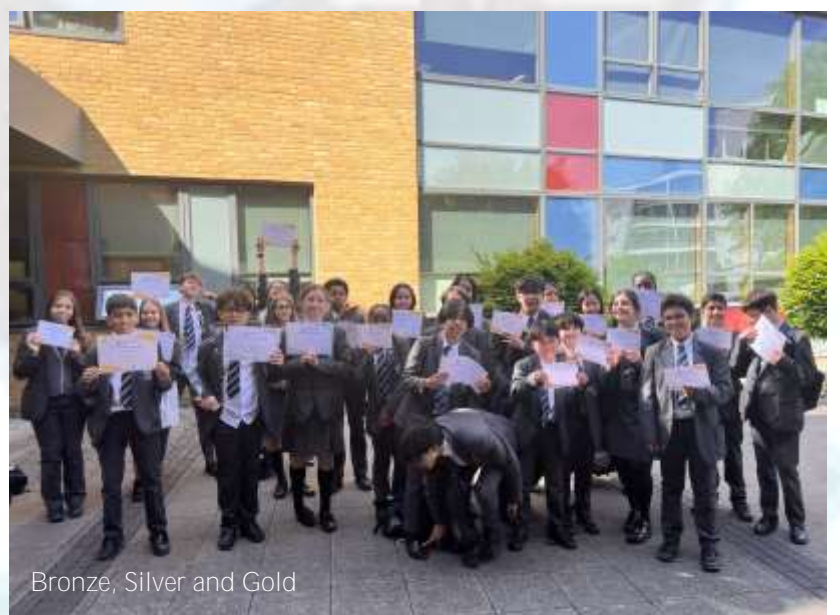
Bronze, Silver and Gold